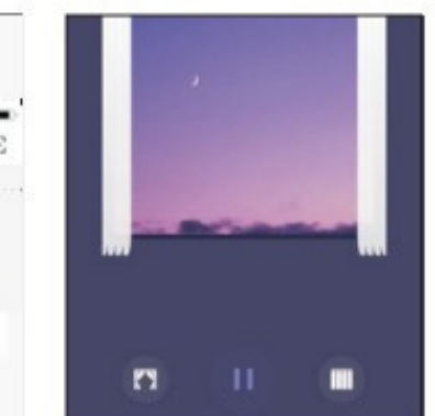
The final operation interface is shown in the figure above.